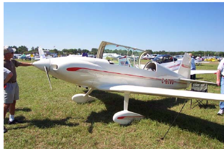
The Nexus Mustang