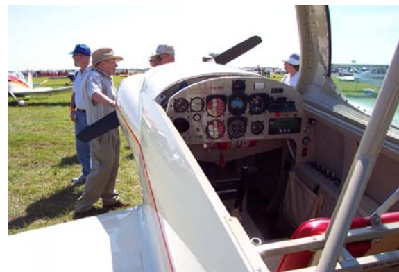
The Nexus Mustang