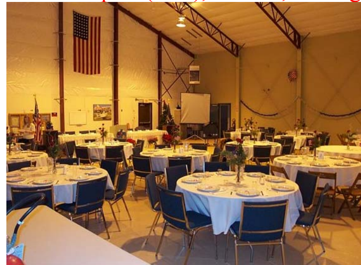
The Yankee Air Museum Fund-Raiser Dinner/Dance Held at the EAA 113 Hangar

Mettetal Airport (1D2), Canton, Michigan