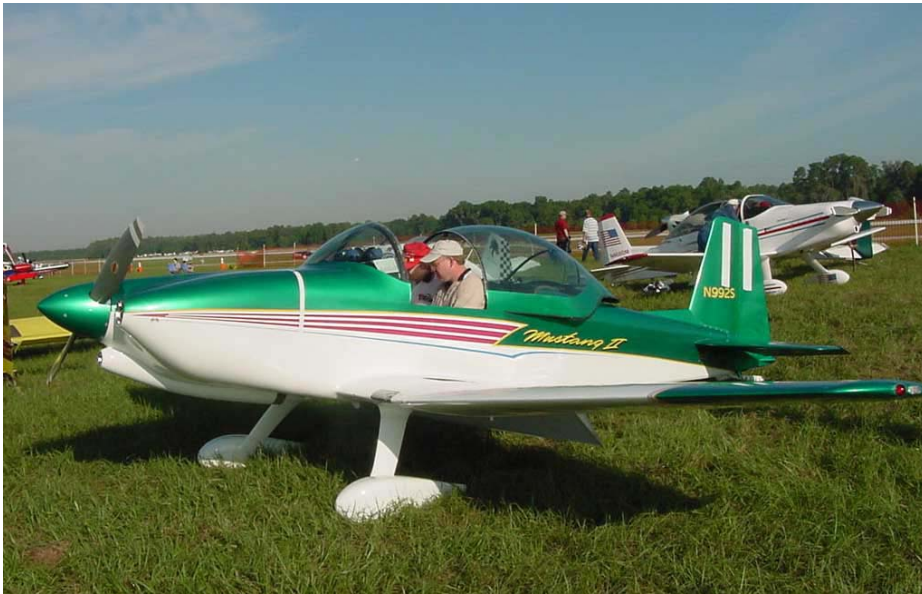
Brian Schmidtbauer's 250 MPH Mustang II

Mustangs are known for their blazing speed. The February 2004 edition of Kitplanes magazine featured Brian Schmidtbauer's 250 MPH Mustang II. With slick aircraft like this gracing the pages of major magazines, the available folding wing option, and excellent quality kits that are now available, interest is increasing and we'll likely see more of these aircraft flying into Oshkosh every year!