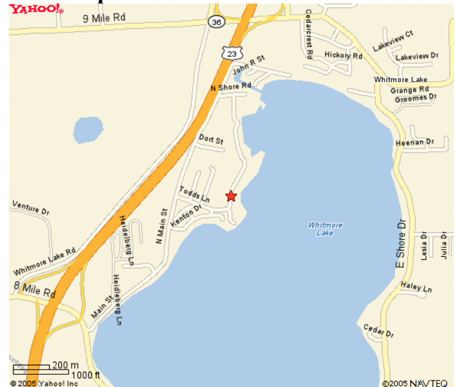
11609 North Shore Road, Whitmore Lake, MI