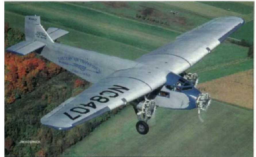
The Ford Trimotor!

..... Mettetal Airport (1D2), Canton, Michigan