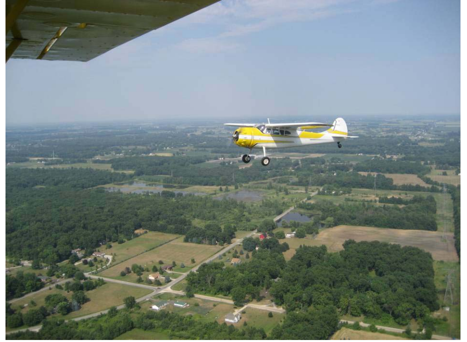
Random shots of EAA 113 members planes!