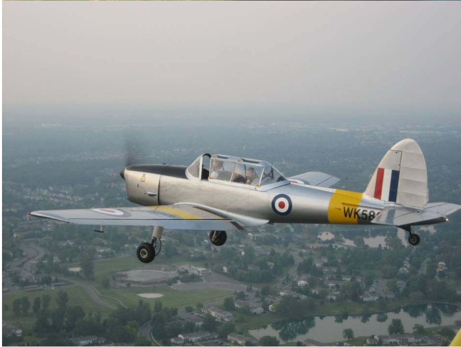
Random shots of EAA 113 members planes!