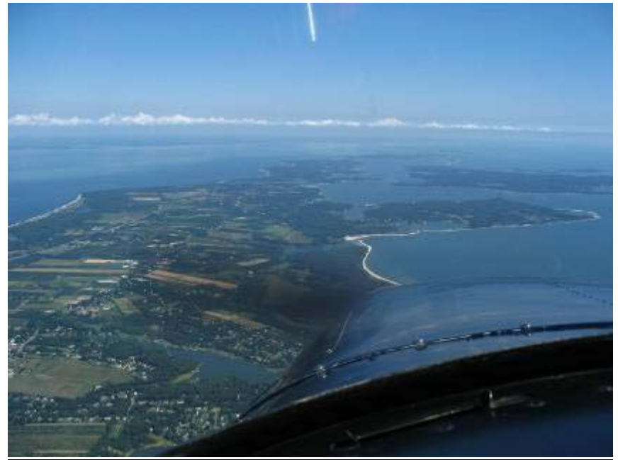
Eastern Long Island