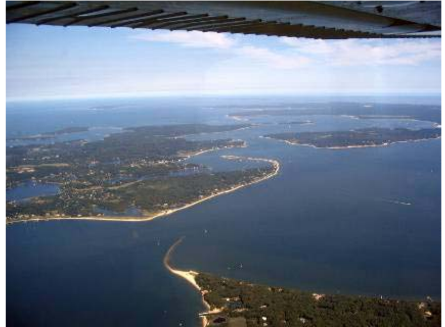
Eastern Long Island

I hope everyone is doing well and I hope to see you when I return 64B to the hanger in the fall. Regards to all, Ernie DiGiacomo.