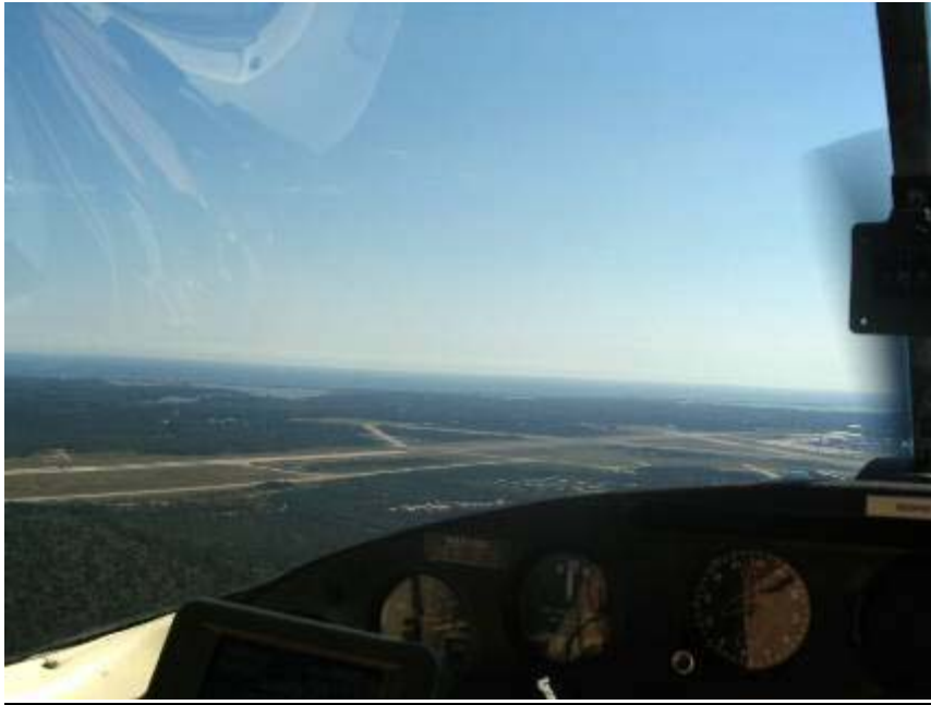
Gabreski Field, home away from home.