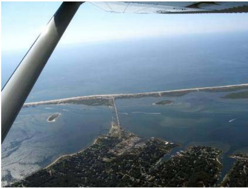
This beach is 3 miles south of our house.