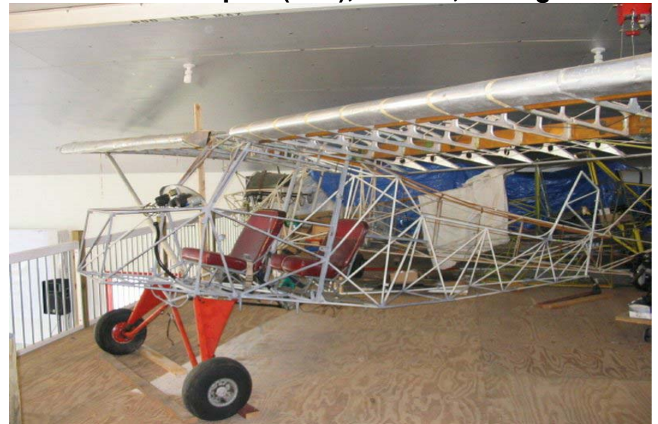
EAA 384 Aeronca Champ 7AC Project

..... Mettetal Airport (1D2), Canton, Michigan